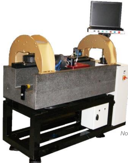
Non contractual photo