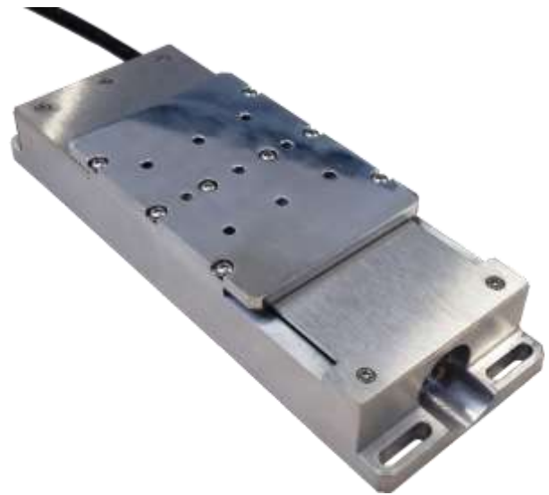
Non Contractual Photo

TMR stages translate with high precision an equipment, a part or a sample.